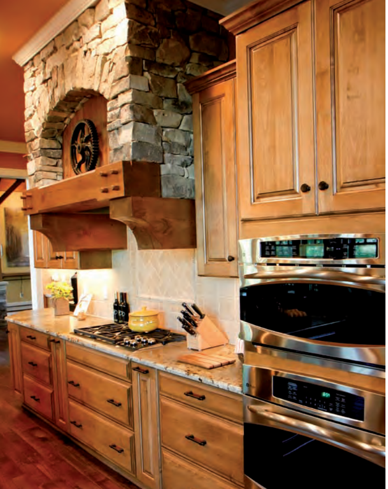
The stove's ventilation is cleverly disguised behind a rough-hewn beam.