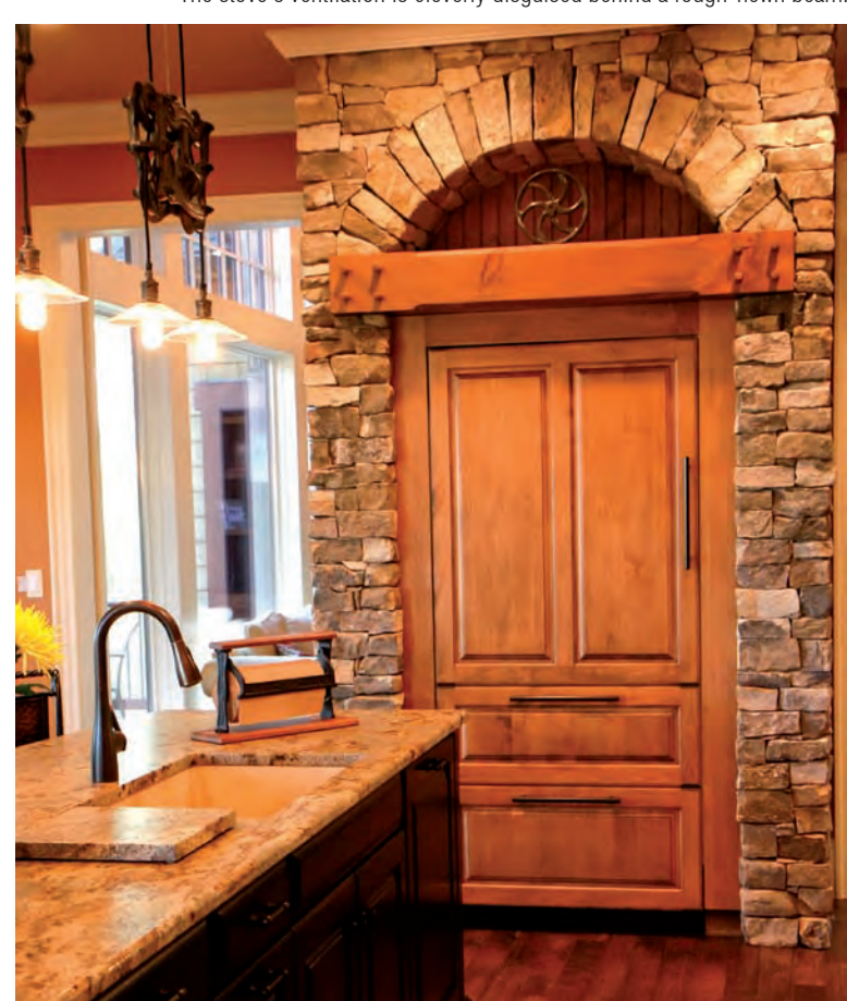
The refrigerator, hidden behind wood paneling, appears to be a doorway.